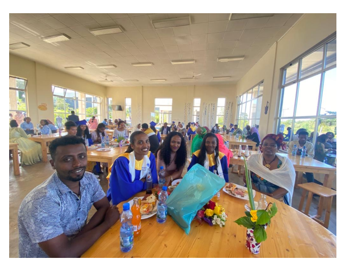
Members of the organising committee