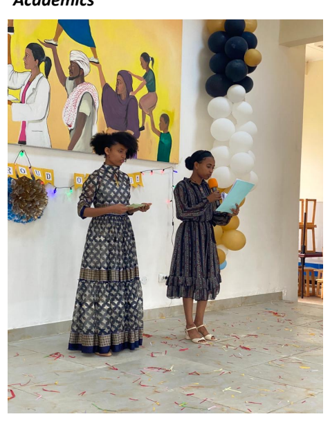
Event MCs; also Homosha students