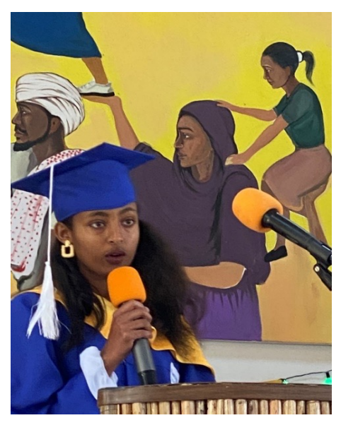
A representative of the graduating class