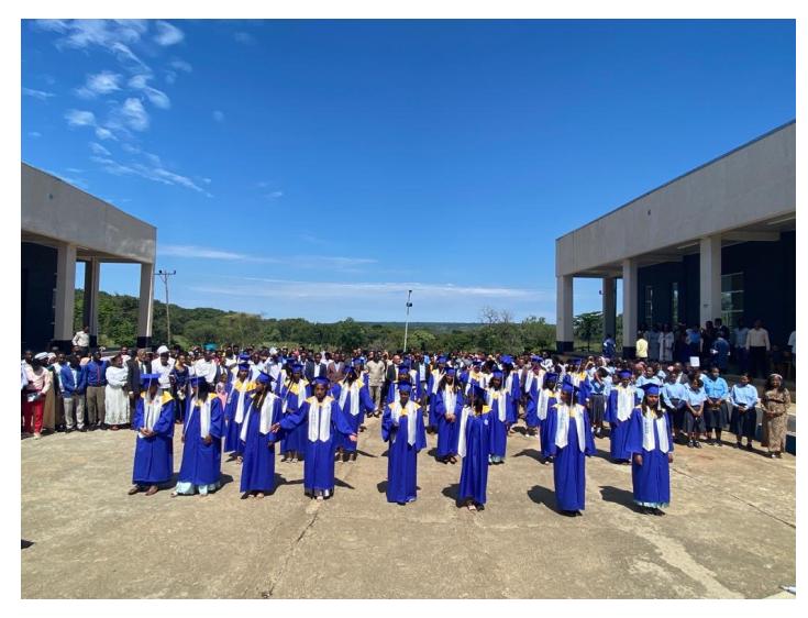
Graduating class of 2022